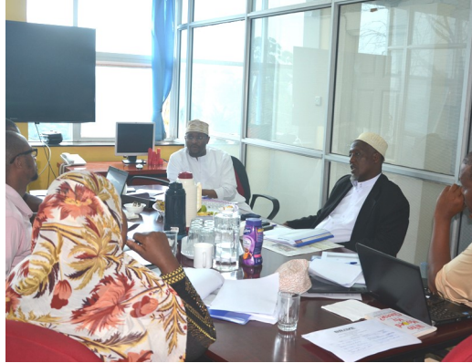
BRAVE Steering Committee Meeting