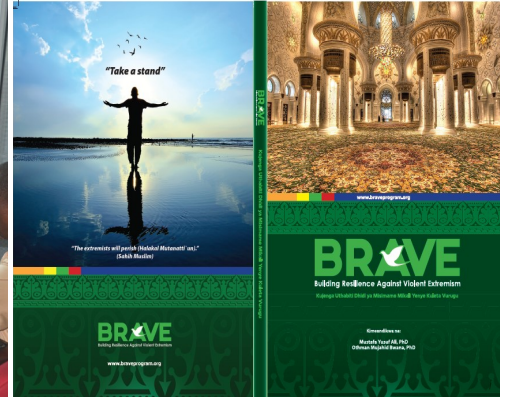
BRAVE Finalizes the Swahili Manual and Popular Version

The BRAVE FOCUS is a monthly newsletter of the BRAVE Movement. This issue, No. 0005, focuses on the BRAVE activities in the month of January 2016;