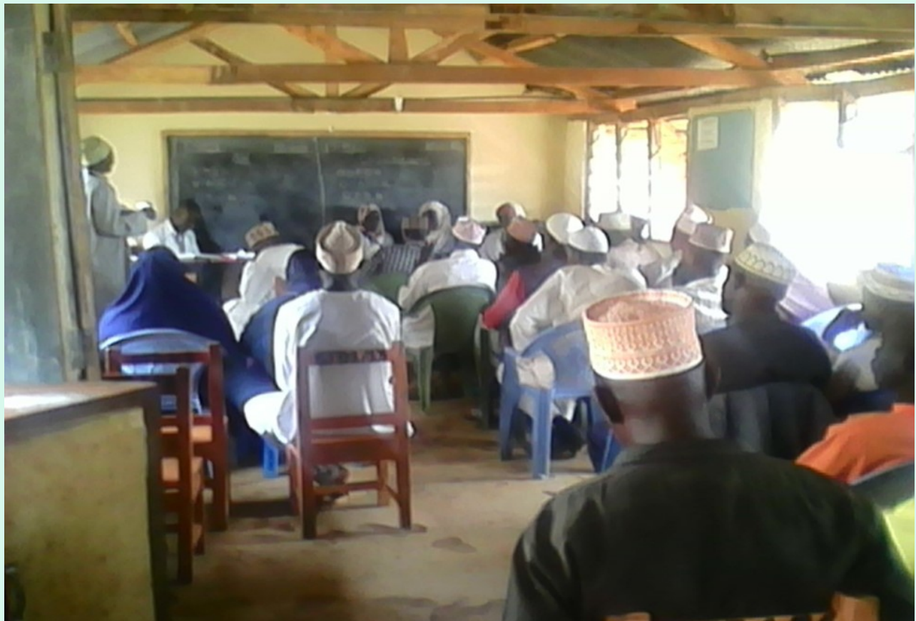
Muslim participants attending the BRAVE Vihiga workshop