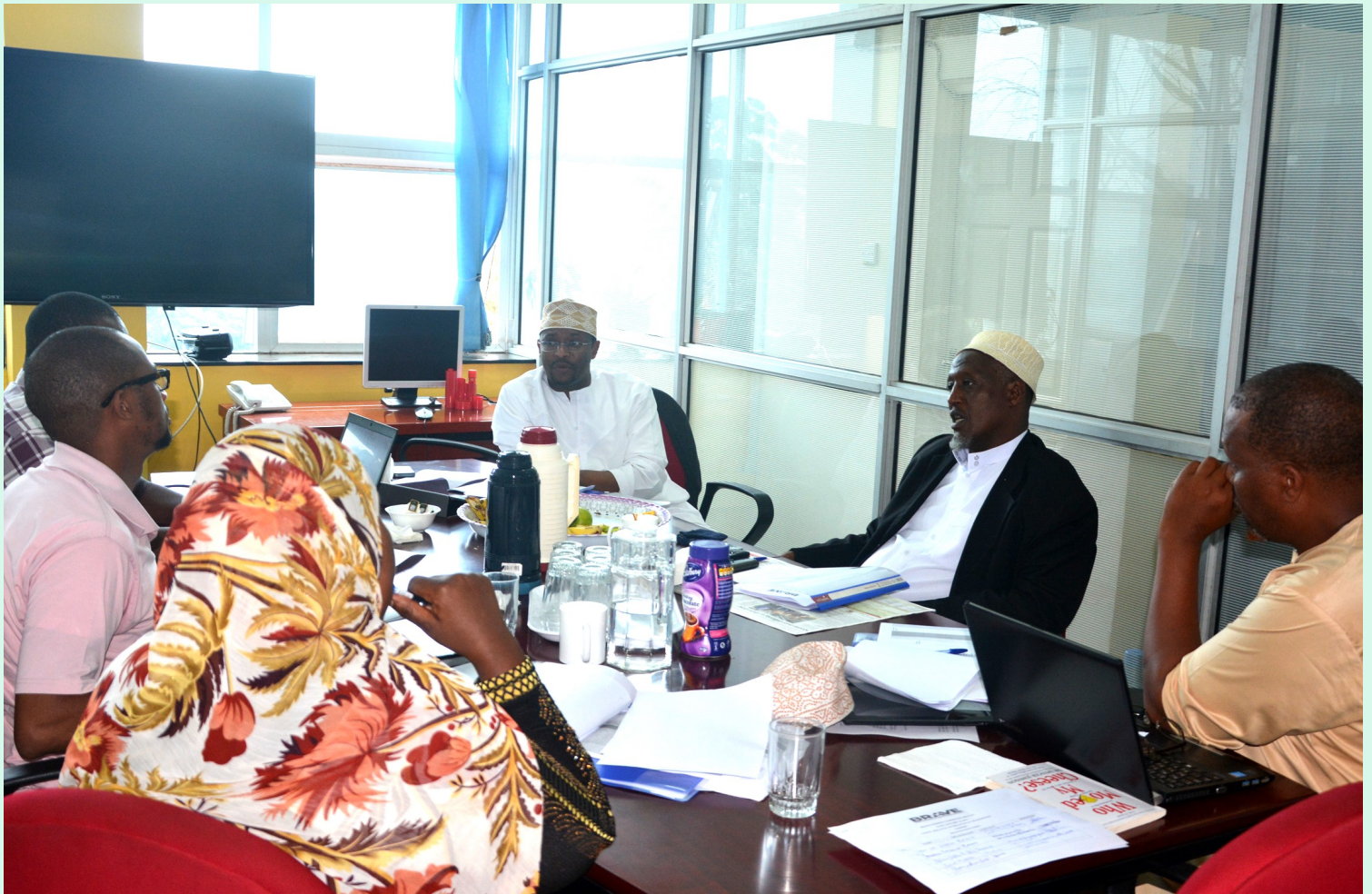
Steering Committee members during their meeting at the BRAVE Secretariat, Nairobi

On 16 th of January 2016, BRAVE held a steering committee meeting in Nairobi to analyze BRAVE's activities for 2015 and the upcoming plans for 2016.