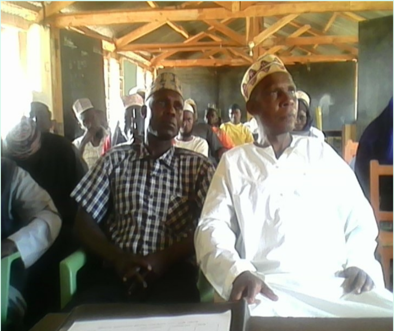
Muslim participants during the Busia workshop