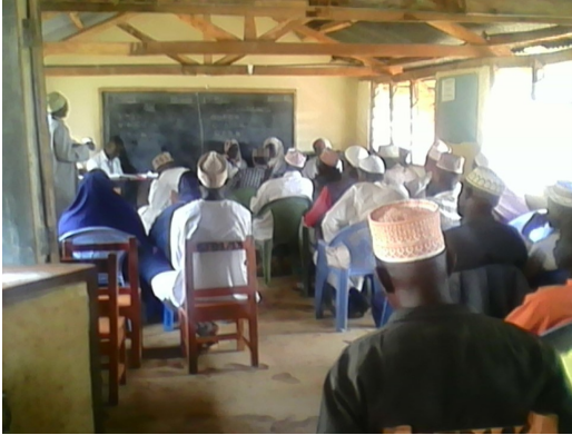
BRAVE Western Conducts Training of Trainers