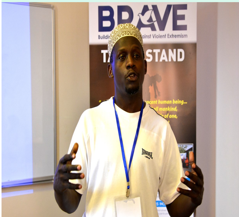
Bro. participating in Trainers' presentation