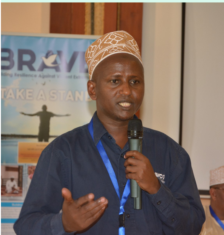
Chief Yusuf Huka elaborating the role of the government in development and peace in Upper Eastern region