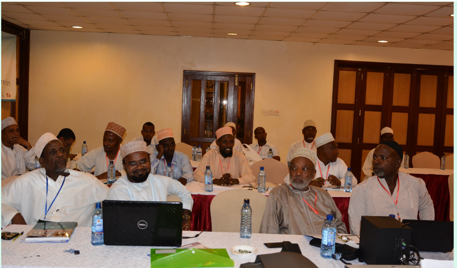
Sheikhs and professionals listening to a presentation during the BRAVE Training of Trainers in Mombasa