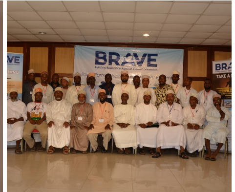
BRAVE Conducts Training of Trainers in Coast Region

T he BRAVE FOCUS is a monthly newsletter of the BRAVE Movement. This issue, No. 003, focuses on the BRAVE activities in the month of November.