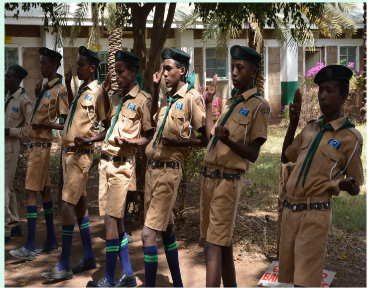
Al-Falah scouts during their drill