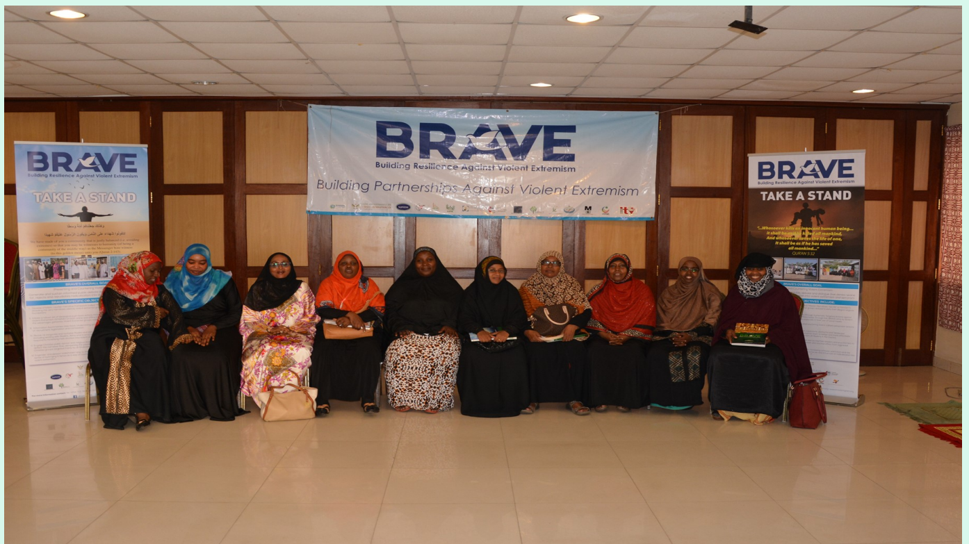
BRAVE Women Trainers Coast region