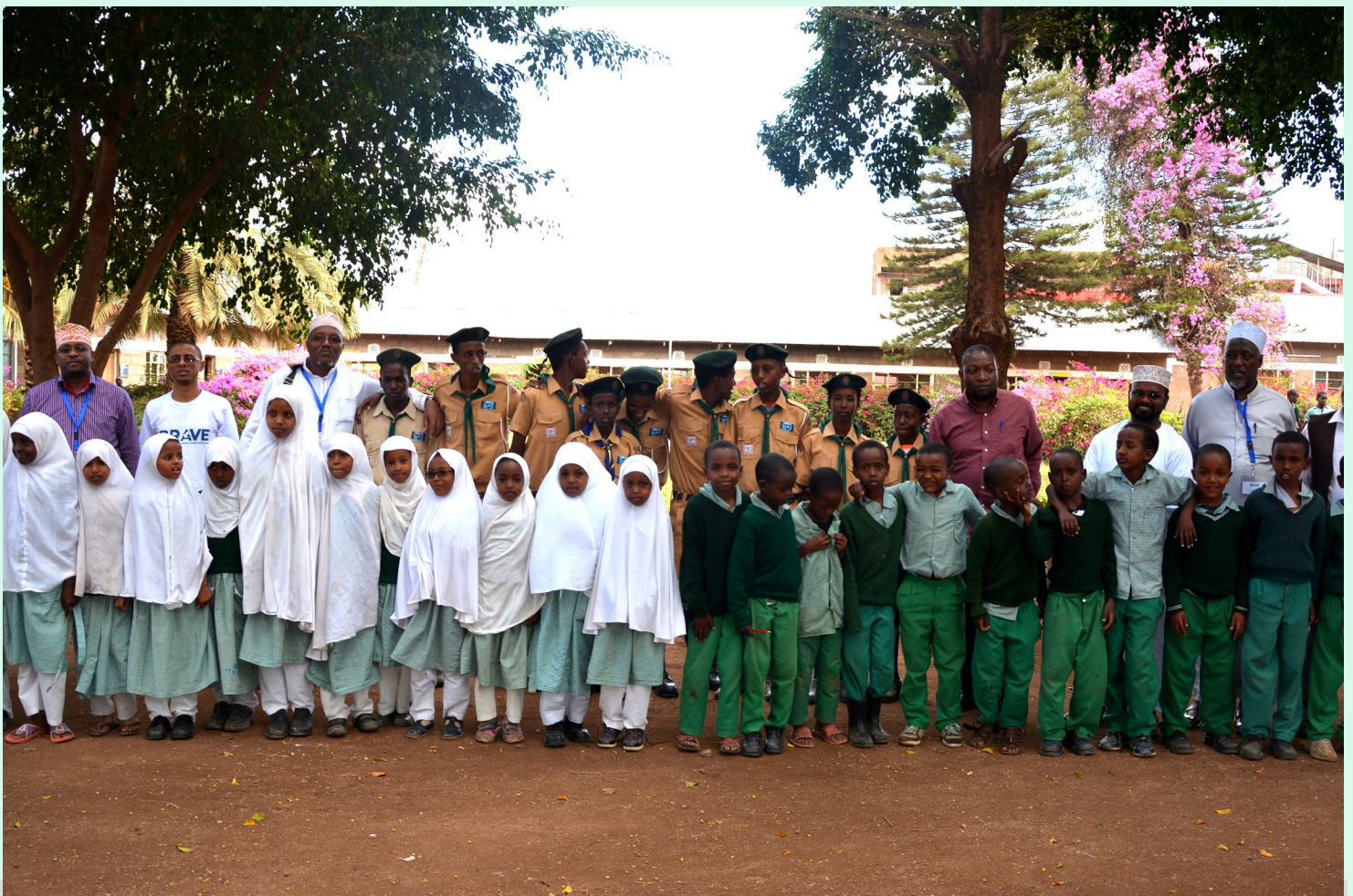
BRAVE team posing with AL-Falah community