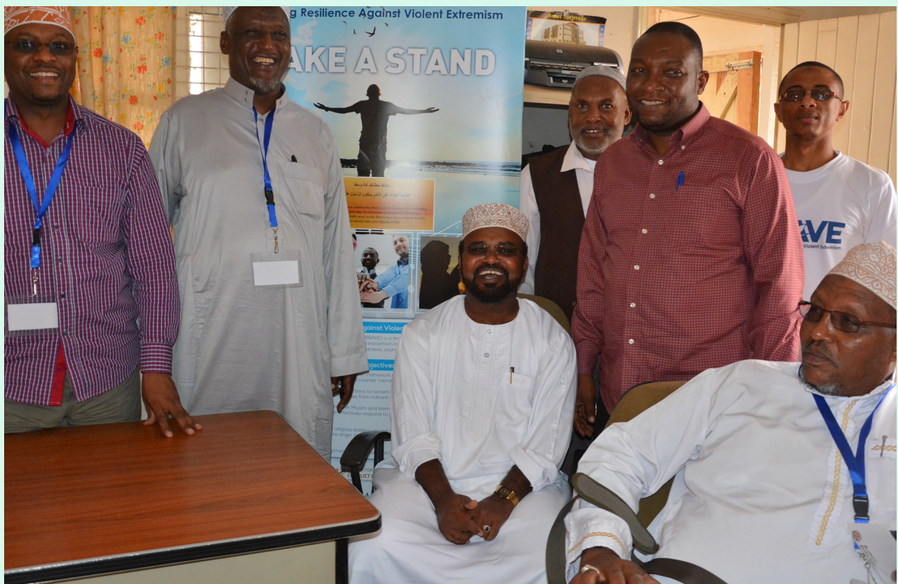
Above, the BRAVE secretariat having their first meeting at the BRAVE Isiolo office. Below, the BRAVE team posing for a group photo in their new office