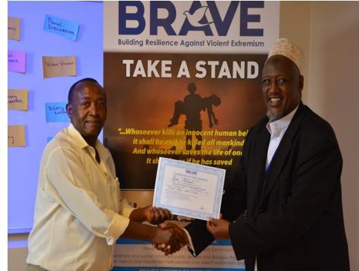
BRAVE Conducts Training of Trainers in Nairobi