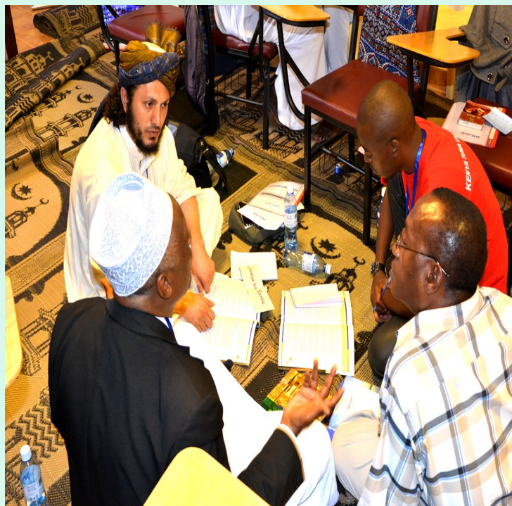
Trainers brainstorming in their group work