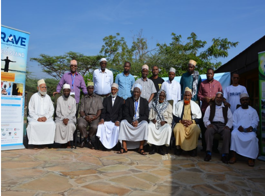
BRAVE Establishes Structures in Upper Eastern