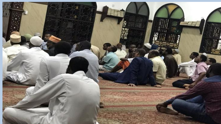
A section of the participants during the public lecture at Masjid Abubakar, Mombasa