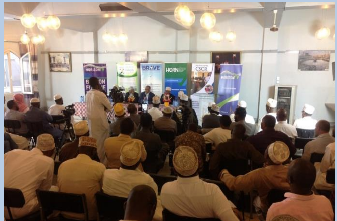
A section of the audience during the Meeting with Imams, Duats and Sheikhs