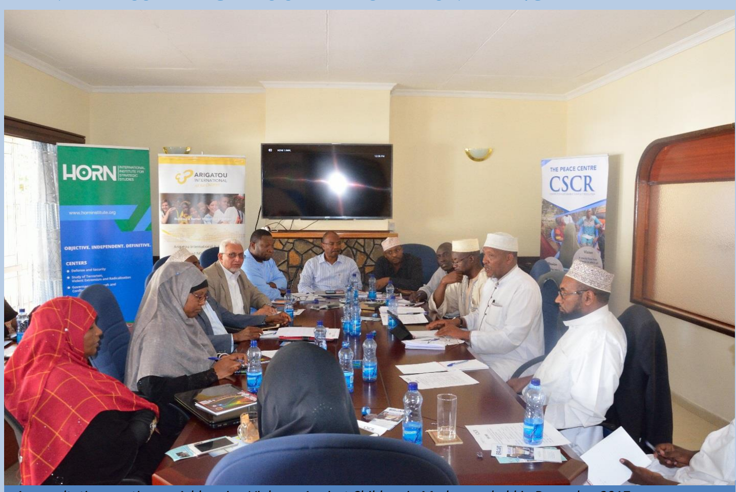
A consultative meeting on Addressing Violence Against Children in Madrassas held in December 2017