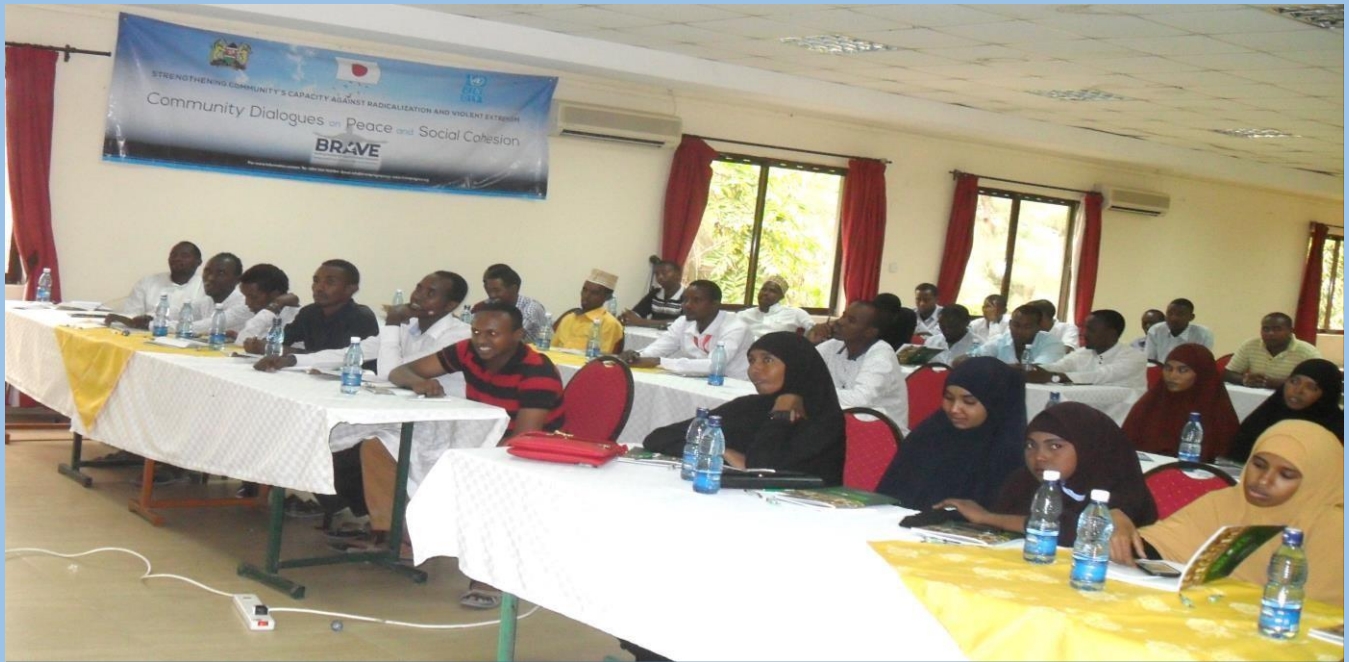
Participants listening keenly during the forum

Theme: Strengthening Community's Resilience Against Radicalization and Violent Extremism Through Madrasa Teachers.