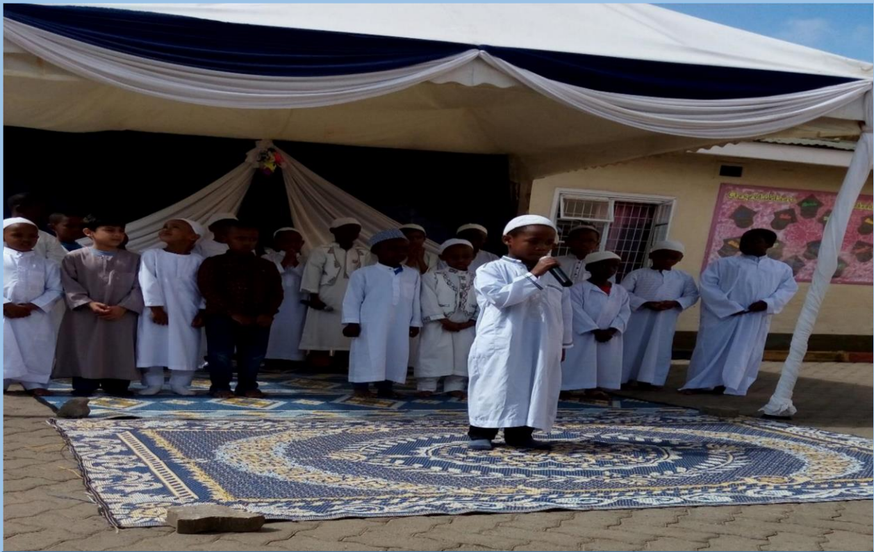
Children at Dar-al-Arqam Academy reciting Poem