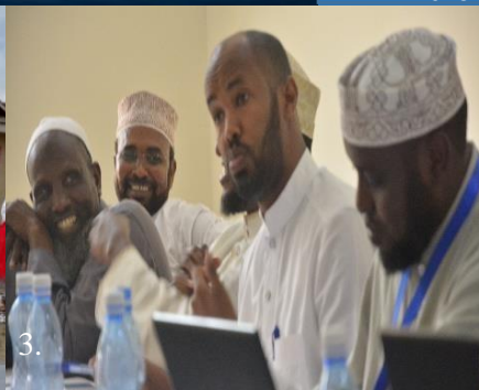
BRAVE at end of year activity in Dar-al-Arqam school