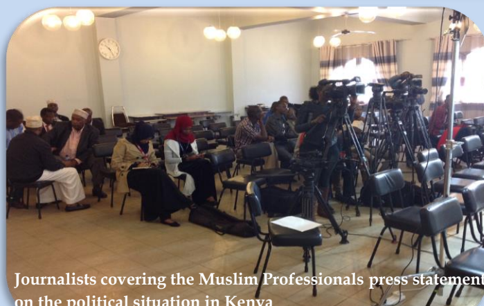
Journalists covering the Muslim Professionals press statement on the political situation in Kenya