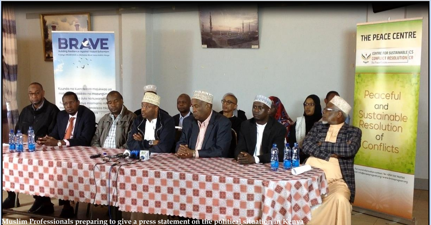
Muslim Professionals preparing to give a press statement on the political situation in Kenya