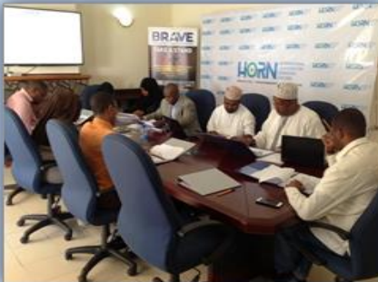
CSCR annual board meeting that took place on 11 th October 2017