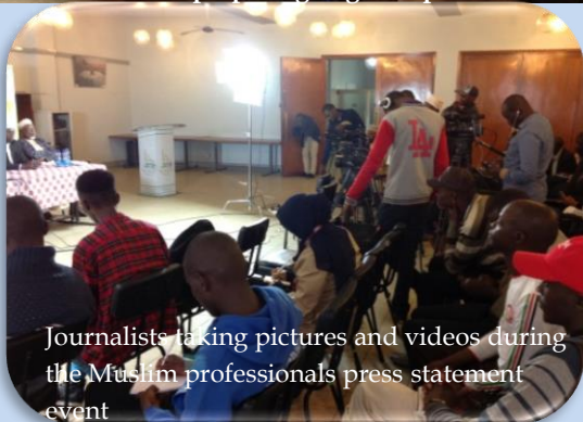
Journalists taking pictures and videos during the Muslim professionals press statement event