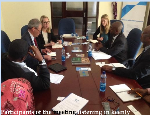
Participants of the meeting listening in keenly