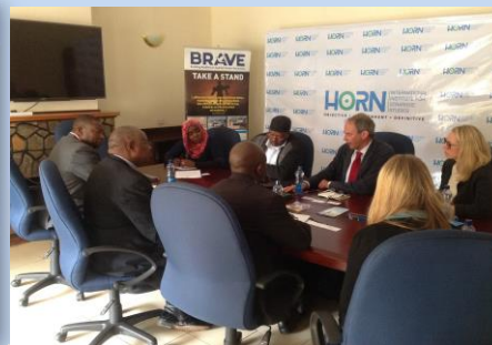
Tony Blair meeting CSCR/ BRAVE at the HORN Institute, Nairobi