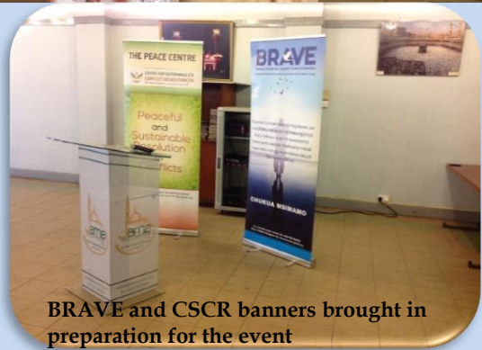
BRAVE and CSCR banners brought in preparation for the event