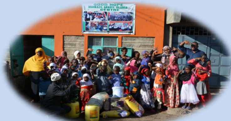
A group photo with the children at their home all cheered up