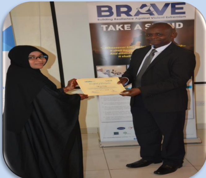
A participant of the BRAVE Women Training of Trainers receiving her certificate after the training