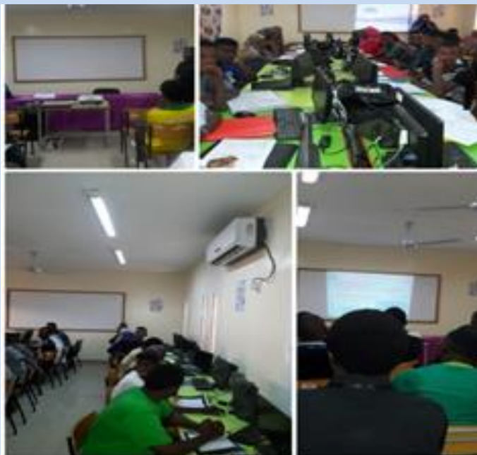
Youth at SOS Center engaging in e-learning visited by the YALI