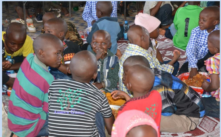
The children of Good Hope Orphanage Center enjoying the feast after the event