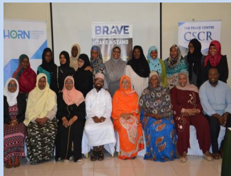
A group photo during the women training of trainers in Machakos.