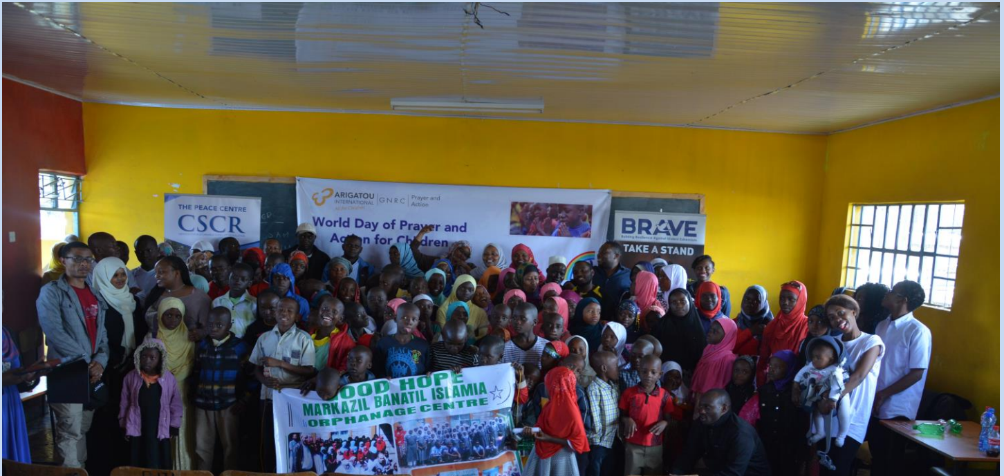
A group photo of Good Hope orphans and members of Center for Sustainable Conflict Resolution and Global Network of Religions for Children (GNRC)-Kenya during the 'World Day of Prayer and Action for Children'