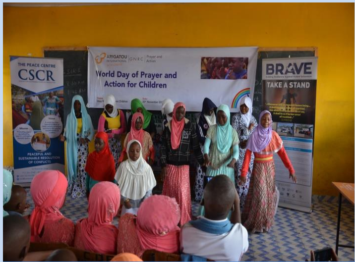
Children from the Good Hope Orphanage Centre performing a dance to shun violence against children.