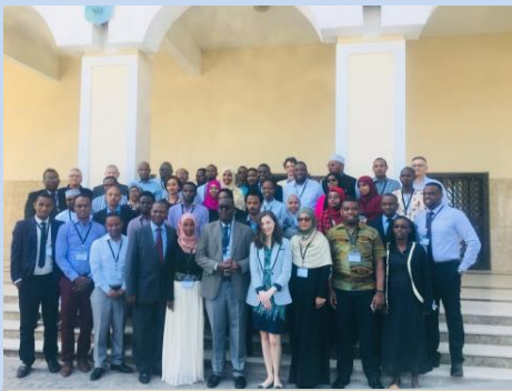
A group photo during the IGAD workshop in Djibouti.