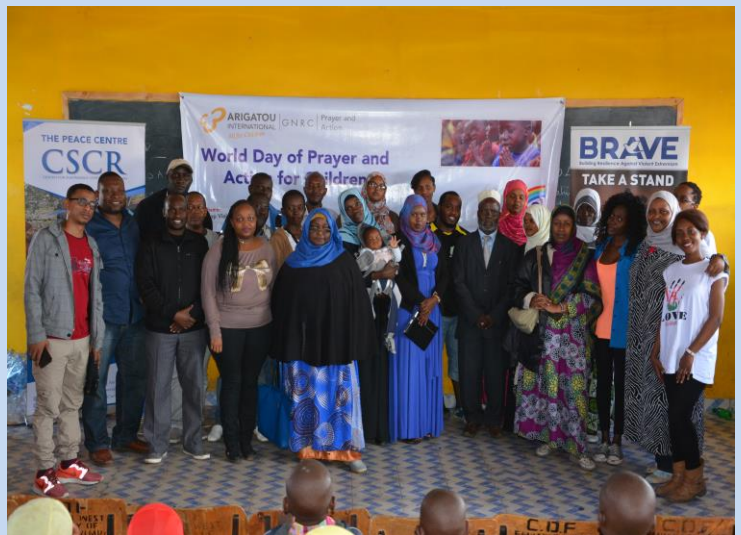
A group photo of members from CSCR, GNRC- Kenya, Entertainment crew and founders of Good Hope Orphanage