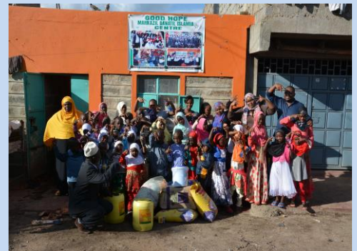
A group photo during the prayer and action for children in Kariobangi.

The BRAVE focus is a monthly newsletter of the BRAVE movement. This issue, number 009 focuses on the BRAVE activities in November 2017. The activities are highlighted below: