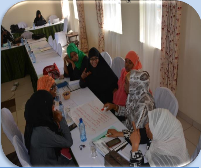
Participants of the BRAVE Women Training of Trainers in a group discussion