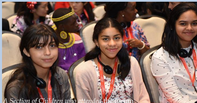
A Section of Children who attended the forum