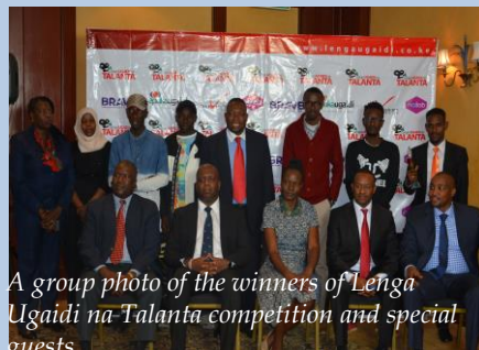
A group photo of the winners of Lenga Ugaidi na Talanta competition and special guests