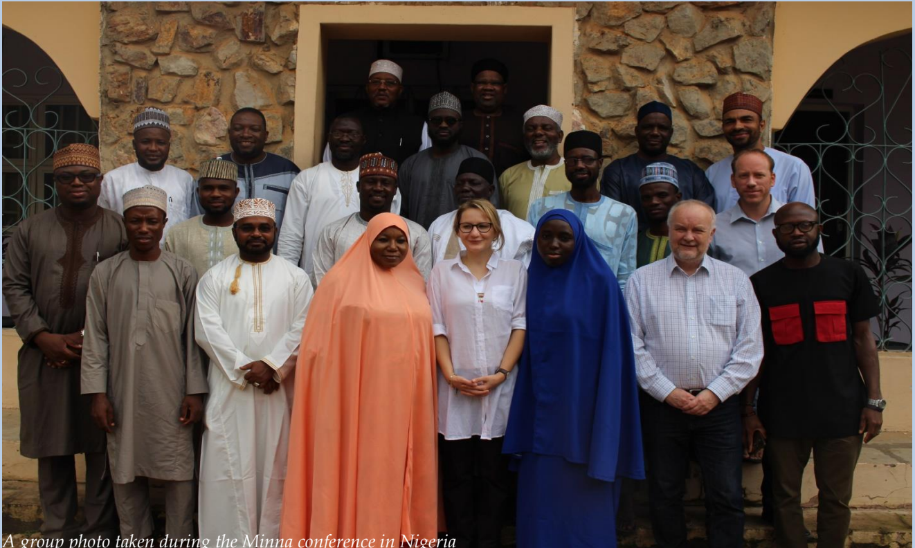
A group photo taken during the Minna conference in Nigeria