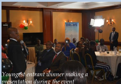
Youngest entrant winner making a presentation during the event