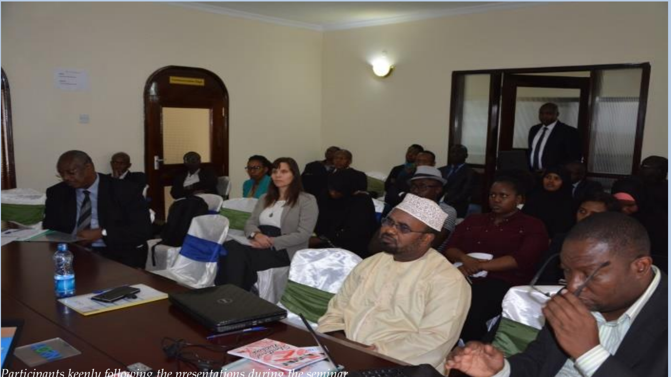
Participants keenly following the presentations during the seminar