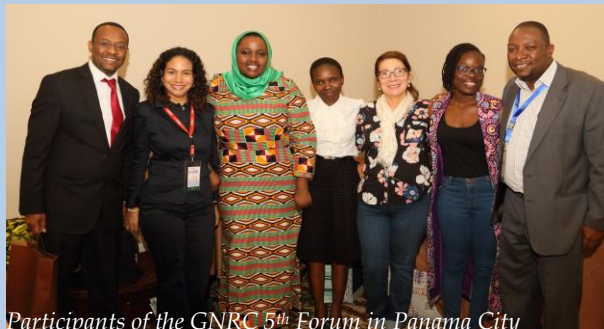
Participants of the GNRC 5 th Forum in Panama City