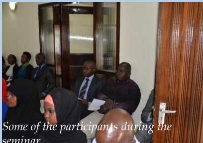
Some of the participants during the seminar