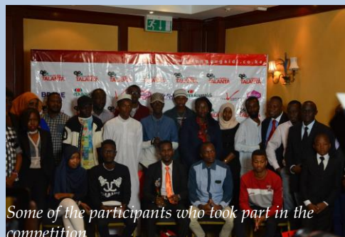
Some of the participants who took part in the competition