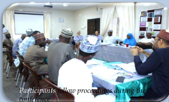
Participants follow proceedings during the conference